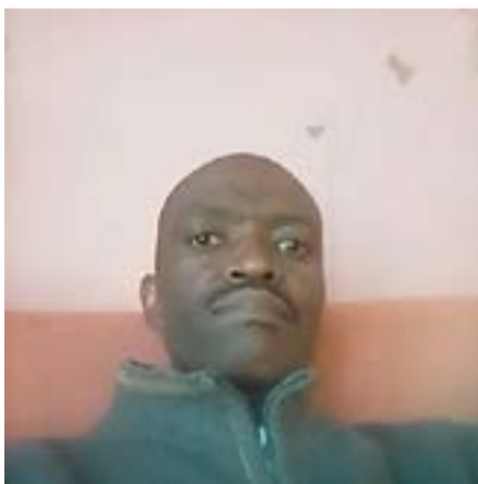
Simphiwe Kitchen Pikini “Molweni enkqubeni basasazi unobangela woku kukuba amapolisa wona kuqala atshomene naba nqevu@Strand”