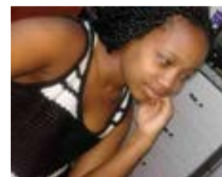
BeYoutiful Nita Fezokuhle Kati Eyonanto eyenza izinga labantu babulawe Butywala dear ayikho enye into...